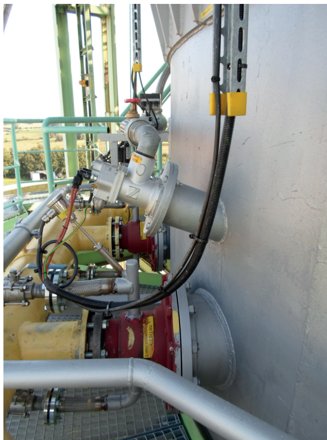
Fig. 6: Two beams plus pilot burner attached to the lime kiln