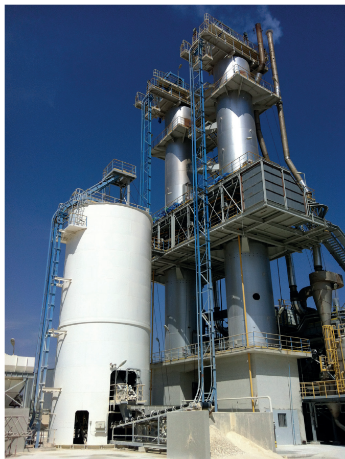
Fig. 1: Eberhardt G type gas-fired kiln

The energy consumption of 2.2–2.7 GJ/t limestone is higher than for solid fuel kilns due to higher exhaust gas temperature and cooling losses.