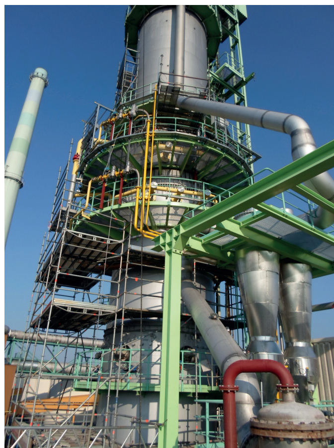
Fig. 2: Eberhardt GDS lime kiln

According to the abovementioned requirements, a gas-firing system has been developed as an adaptation of the proven burner beam system. It features two combustion levels with double walled pipes with an integrated cooling water chan-