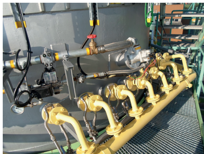
Fig. 5: Lances of gas fired lime kiln

Figure 5 shows the setup of lances with the small flexible cooling connections and the pilot burner in the center. Figure 6 shows two beams and another pilot burner which is situated above.